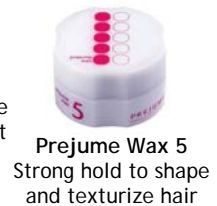
Prejume Wax 5 Strong hold to shape and texturize hair