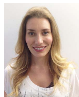
Total service time: 2 hours