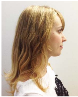
Total service time: 1.5 hours