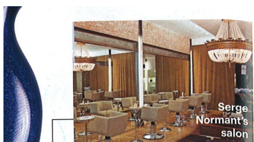
Serge Normant's salon