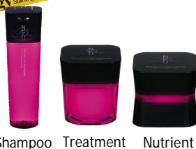
Shampoo Treatment Neutrient

Featured in the August issue of Self Magazine, Neu Due provides a luxuriously smooth feel and hydrates even the most thirst-quenching hair. You'll find your hair irresistible to the touch!