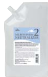
Milbon Perm Neutralizer 2 Available Size: 800ml (27.1fl oz) (10 heads)